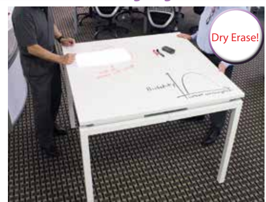
OFD-BI4848CONF-SH-MB-BS - 48"x48" Standing Ht Erasable White Markerboard Table Top, Brushed Silver Legs.....List $1,986 OFD-BI4848CONF-SH-MB-WH - 48"x48" Standing Ht Erasable White Markerboard Table Top, White Legs.....List $1,986

MARKERBOARD Standing Height Table - 38.5" H