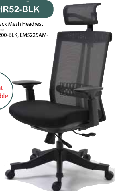
EM5225AM-BLK with an added Headrest

Opt. Black Mesh Headrest Only for: EM5200-BLK, EM5225AM-