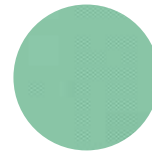
(-AQUA) Aqua Green