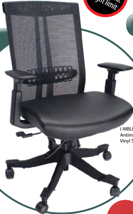
(-MBLK) Black Antimicrobial Vinyl Seat